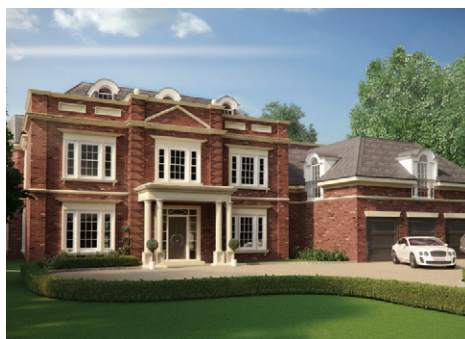
101 Silverdale Avenue