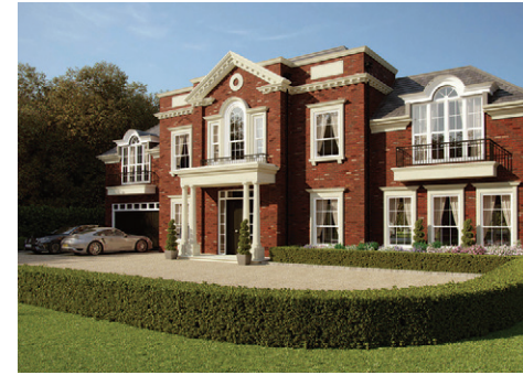
11 Eriswell Crescent