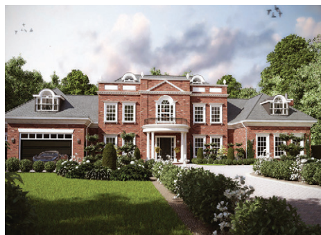
27 Chargate Close