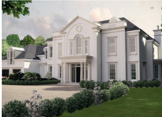
64 Cranley Road, Burwood Park