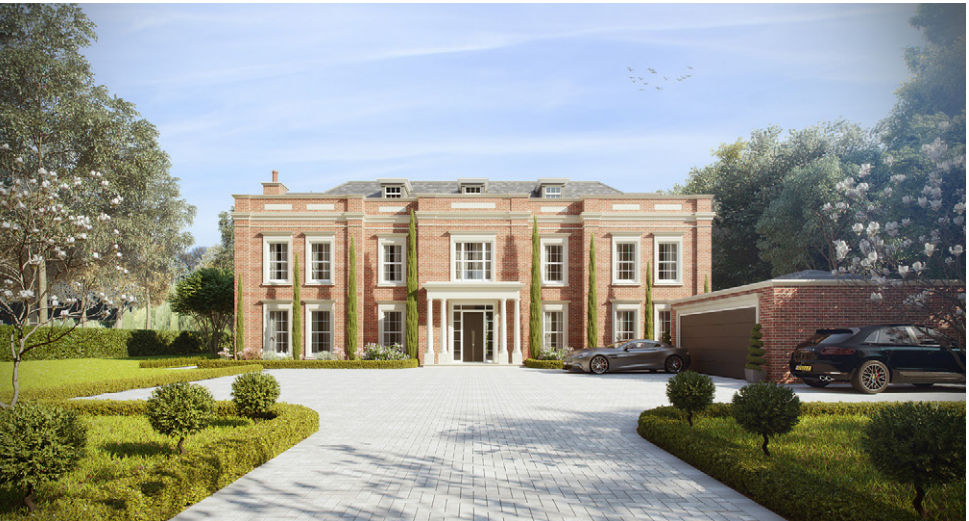
14 Eriswell Road