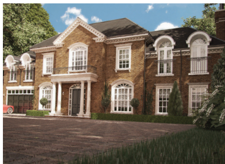
5 Chargate Close