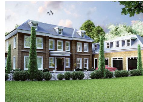
174 Ireton Avenue