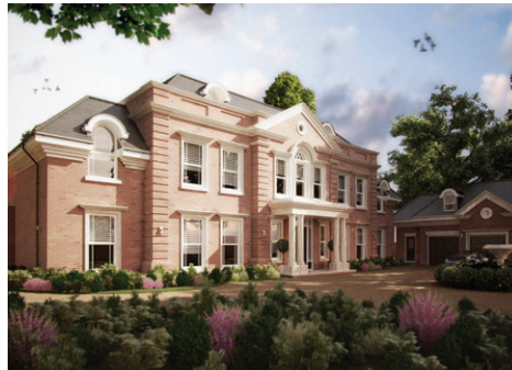
Sunhill, St Georges Hill