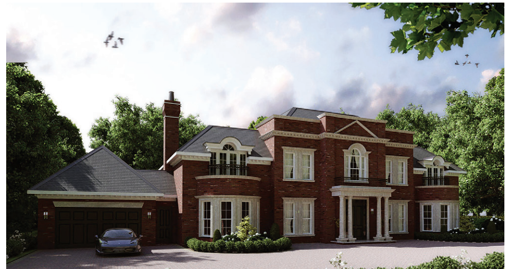
1 Albury Road, Burwood Park