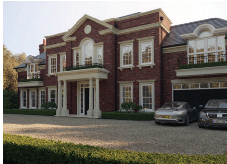
29 Broadwater Road