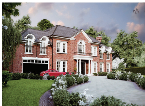
7 Cranley Road