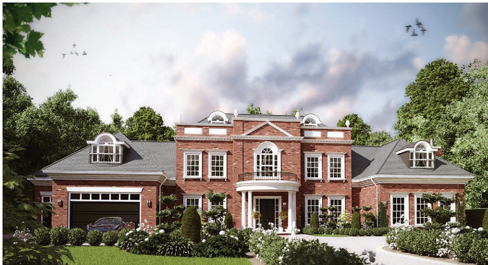
27 Chagate Close, Burwood Park