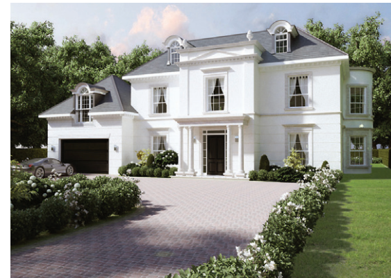
16 Ince Road, Burwood Park