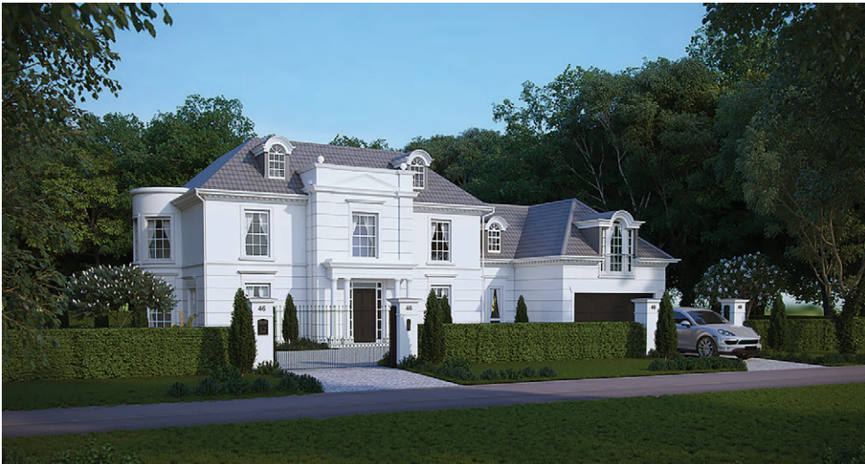
46 Onslow Road