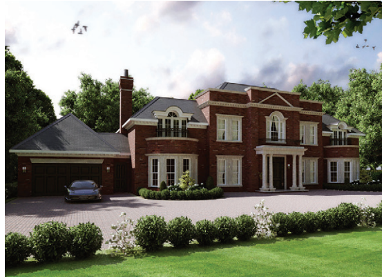
1 Albury Road, Burwood Park