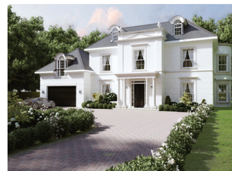
16 Ince Road