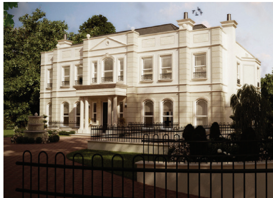
Towercross, St Georges Hill