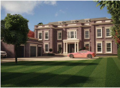
10 Cranley Road