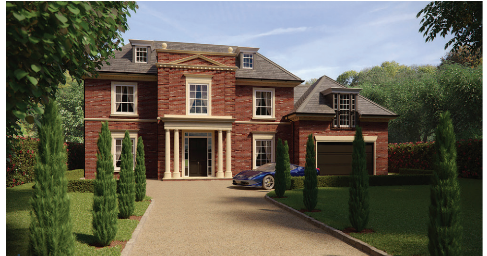
21 Onslow Road, Burwood Park

These were either as funded development projects, or as a design and build for an end user client.