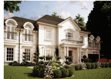
2 Cranley Road