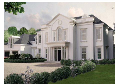
64 Cranley Road