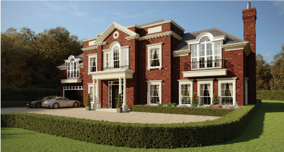
11 Eriswell Crescent