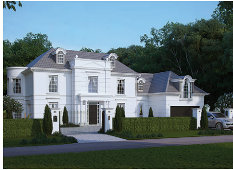
46 Onslow Road