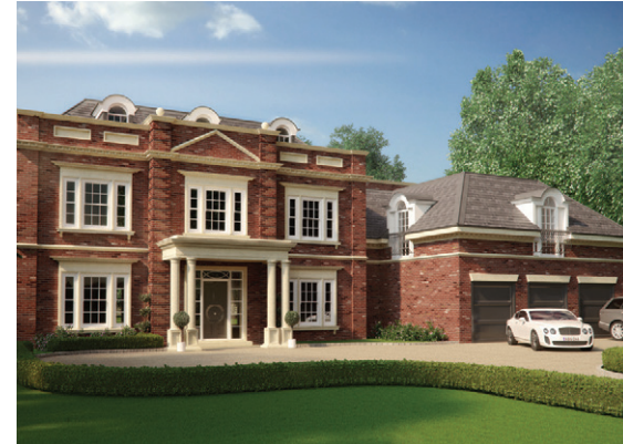
101 Silverdale Avenue, Ashley Park