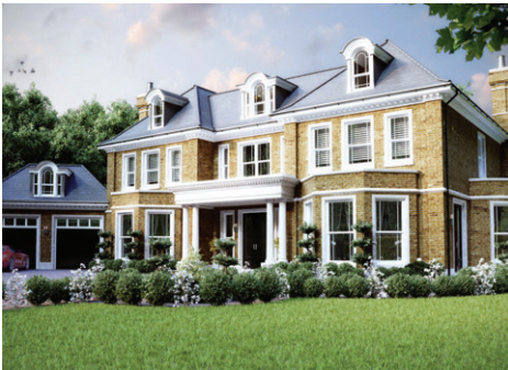
11 Cranley Road