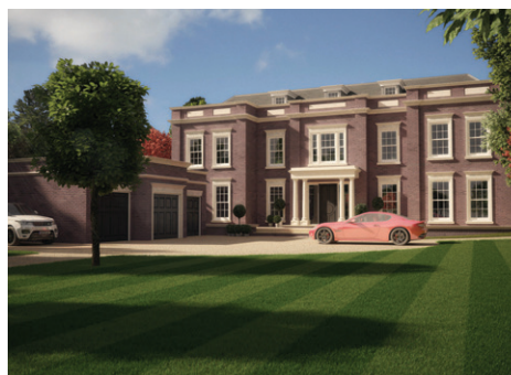
10 Cranley Road